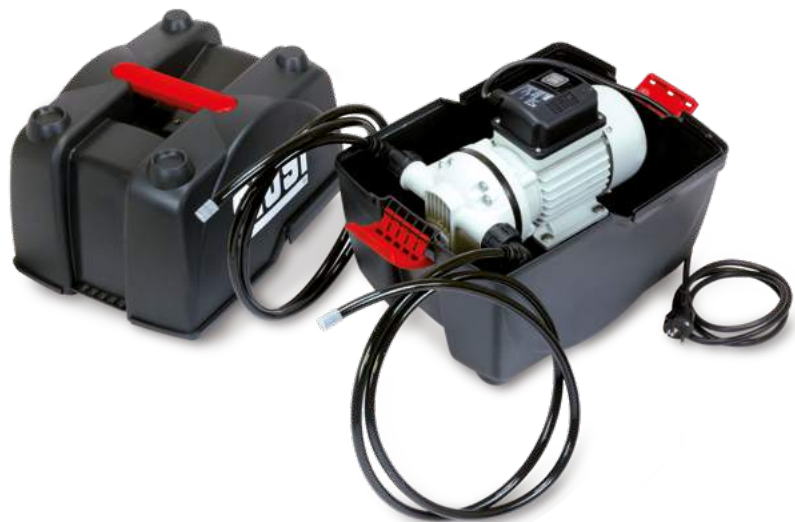
PIUSIBOX CAR SUCTION